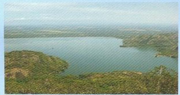
Aliyar Dam, The Anamalais