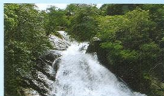
Monkey Falls - Aliyar, The Anamalais