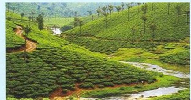
Tea Estate - Valparai, The Anamalais