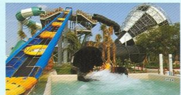
Black Thunder - Mettupalayam, Coimbatore