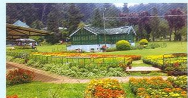
Sims Park - Coonoor, The Nilgiris