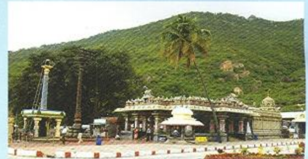
Lord Muruga Temple - Maruthamalai, Coimbatore