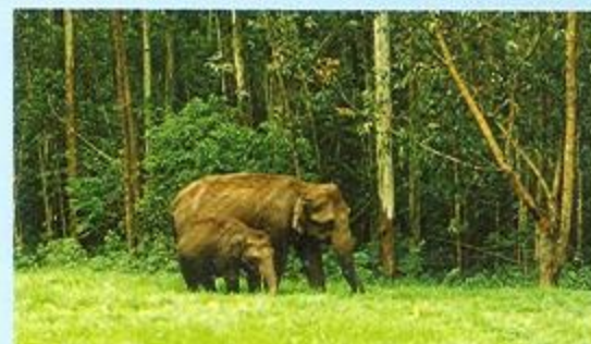
Wild Life Sanctuary - Mudumalai, The Nilgiris

Two papers (one oral and one poster) will be selected from each section for the best oral and poster presentation awards. The prizes will be distributed in the valedictory function of the congress.