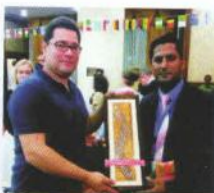
Hon' Mr. Salavat Sajitov Dy. Prime Minister -Bashkortostan