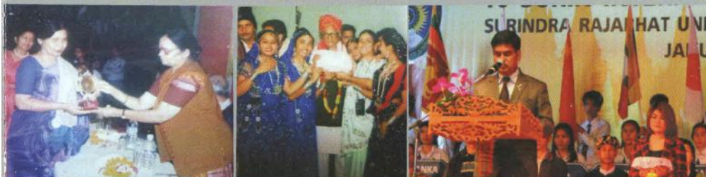
Hon' Mrs.Mridula Sinha Presenting Awards