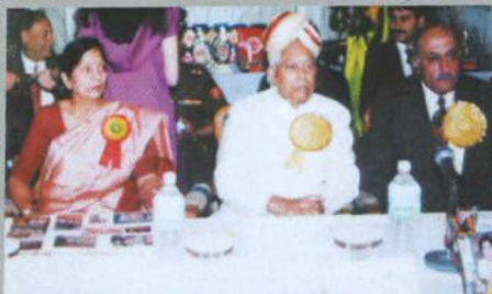
H.E. Dr.Suraj Bhan -Governor & Lt. Gen. Kapil Vij with Mrs. Toshima at Award Ceremony at Shimla

All water / acrylic / poster / oil / black pencil / charcoal art work done on papers must be mounted. Breakable frame will not be accepted. Do not use glass – use wooden frames. Do not send incomplete wet or heavy textures paintings.