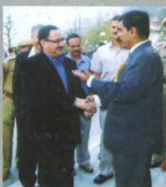
Welcome of Sh.J.P.Nadda(Minister Now Act. President of BJP