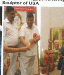
Hon' Sh. Anil Agarwal (MP) Inaugurating Painting Exhibition at Ghaziabad