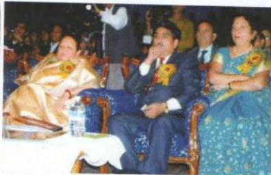
H.E. Hon' Urmila Singh (Governor of H.P) at Folk Dance festival at SHIMLA