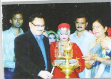
Sh. J.P.Nadda inaugurating CCF International Folk dance festival

Awards Ceremony : There are many Prestigious Awards of Thousands of cash (INR)+Merit certificates / Trophies/ Mementoes. Special honor to Sr. Artists. * Invitation to winning Candidates to join Indian/ International Fine Art Camp (T & C apply). Award Ceremony VENUE & DATE will be informed. Many VIPS, Bureaucrats, Artists along with general visitors ,Print and Electronic Media are being invited to grace the event.