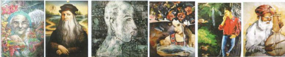
Paintings done by the Students participated in our CCF Painting Competitions