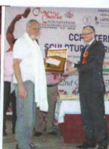
H.E. Mr Hatem El Sayed Tageldin Ambassador of Republic of Egypt honoring Sculptor of USA