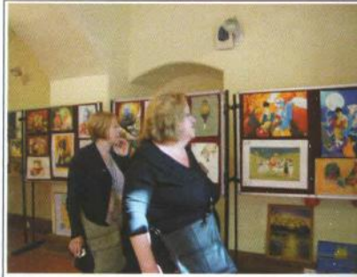
Visitor at Art Exhibition at Gaiety Theatre -Shimla

(Students of India & Abroad) MFA/ BFA /Graduate / PG, X to XII students (16 to 30 years).