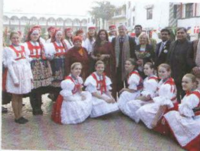
H.E. Hon' Milan Hovarka -Ambassador of Czech Republic to India at Folk Dance festival in Ghaziabad

CCF successfully organized CCF SCULPTURE CAMP & WORKSHOP in association with Lalit Kala Academy (Government of India) in which prominent sculptors from USA, Egypt and India participated for 10 days at Ghaziabad.