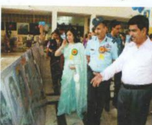
Air Comm. Anil Sabarwal (AOC-Hindan Af. Stn.) inaugurating Art Exhibition at Sahibabad (Gzb)