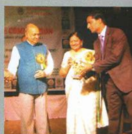
Prof. Prem Kumar Dhupal Chief Minister HP at Award Ceremony