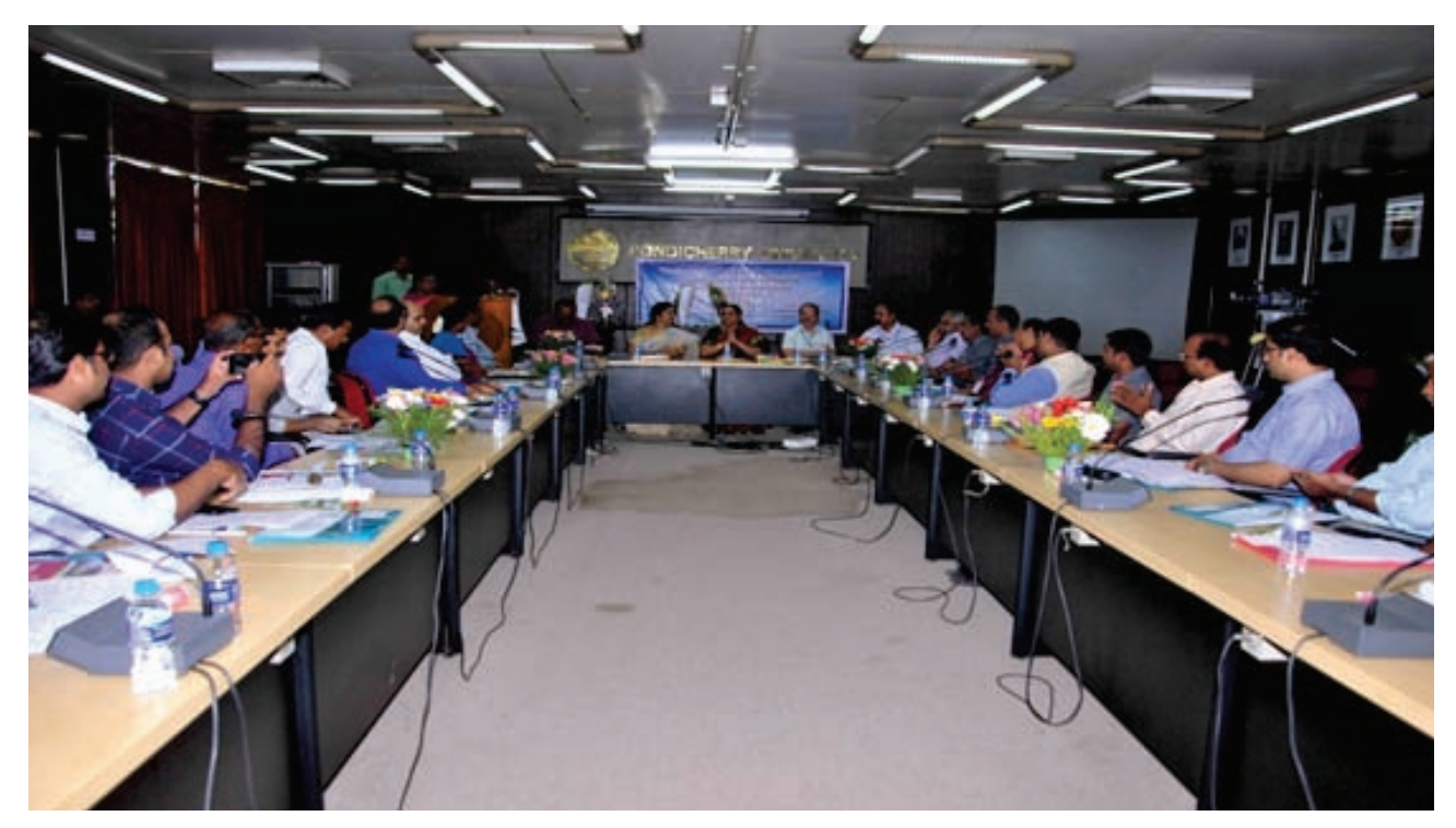
One-day National Workshop with all Co-ordinators of Twinning Programme, Spot Admission & Exam Centres held on March 24, 2017