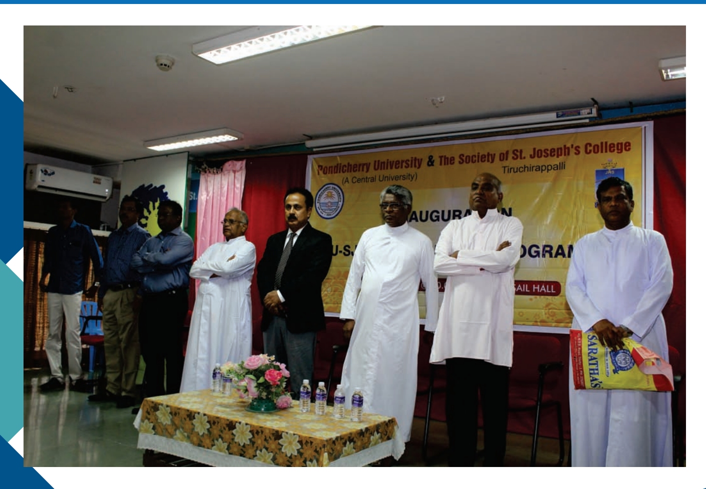
Inaugural Function of Twinning Program at St. Joseph College, Trichy held on July 30, 2017