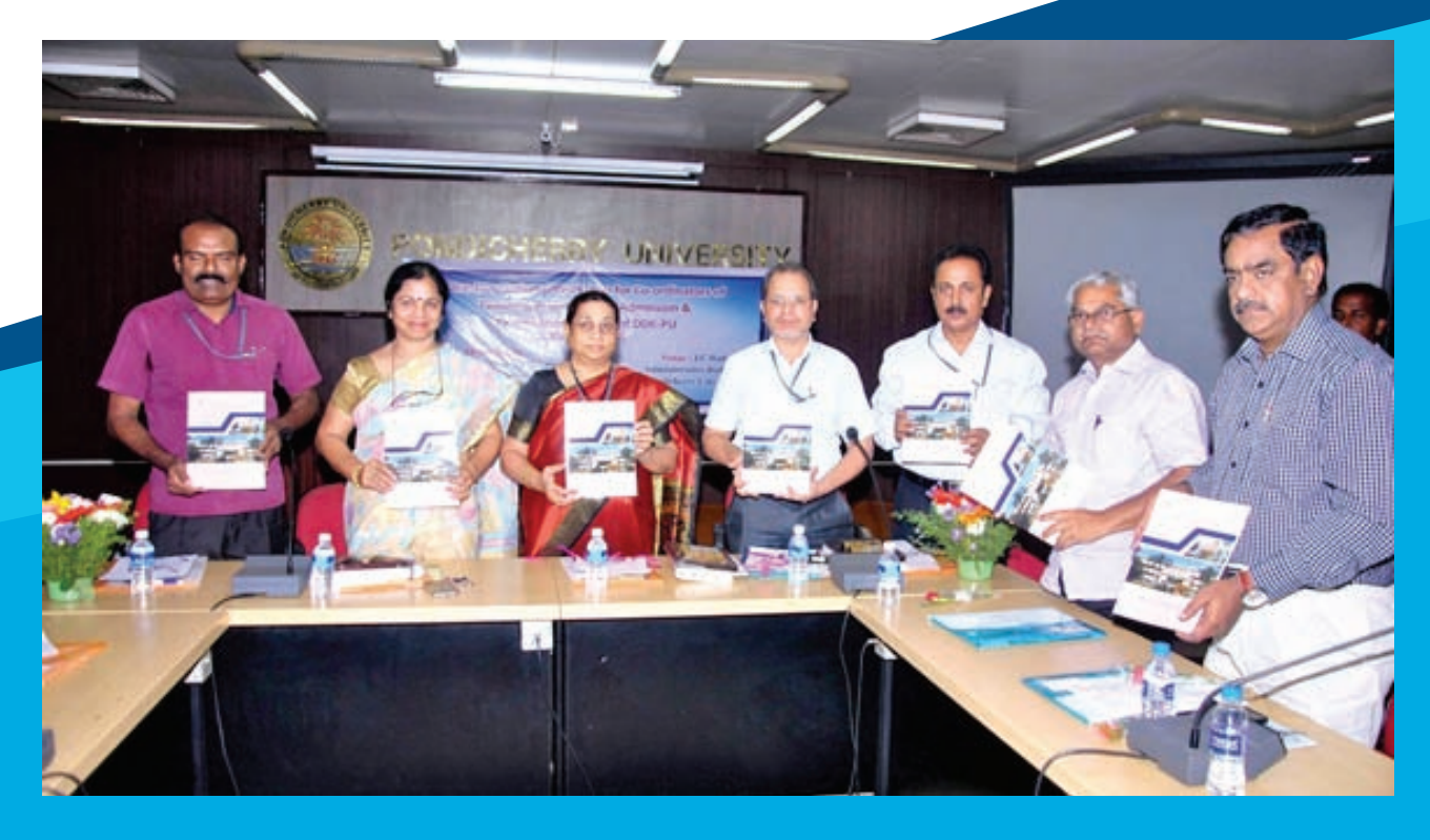
Release of Report of Two-day National Conference on Distance Education on March 24, 2017