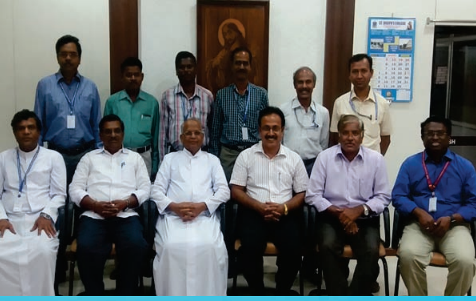
DDE of Pondicherry University Signed MoU with St. Joseph College, Trichy on March 24, 2017